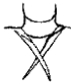
8. Cross long end over short at the "V"