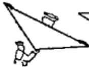
4. Place the first 2 fingers of right hand across corner, thumb below. Fold up and over fingers to the right.