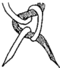
11. Bring long end back and thru the formed loop.