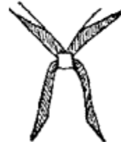
12. Shape knot as shown. Top of knot even with bottom of "V". Ends same length.