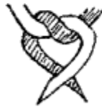
10. Cross long end over short